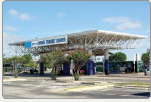
Lamar Transit Center (park and ride)