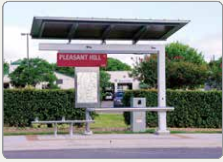
Bus Rapid Transit stations (currently under construction)