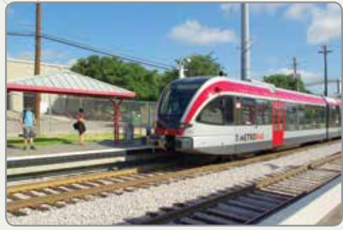
Kramer MetroRail Station