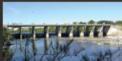
12 - Longhorn Dam