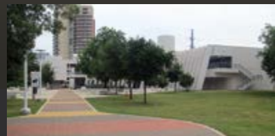
10 - Mexican American Cultural Ctr.