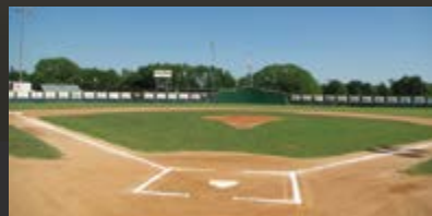
11 - Mendoza Baseball Field