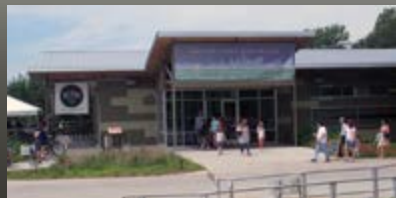
9 - Waller Creek Boathouse