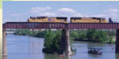
2 - Union Pacific Rail Bridge