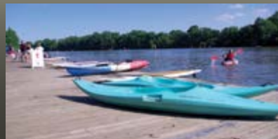
7 - Texas Rowing Center