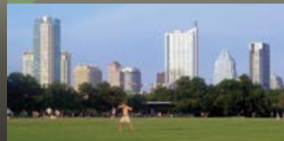
5 - Zilker Park