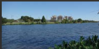
13 - View from S. Lake Shore Park