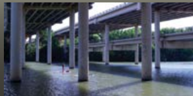
6 - MoPac