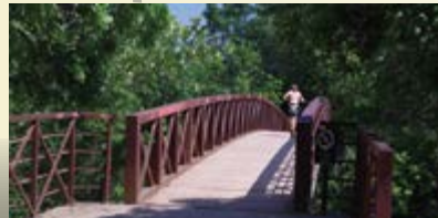
3 - Bridge at mile 1