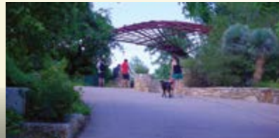
4 - Gazebo at Lou Neff Point