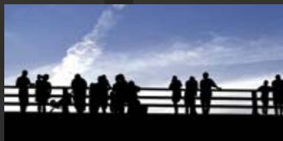
15 - Congress Ave