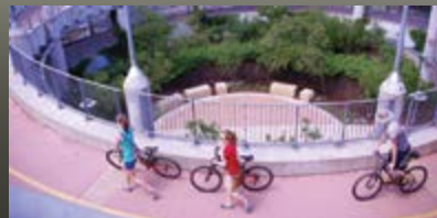
8 - Pfluger Pedestrian Bridge