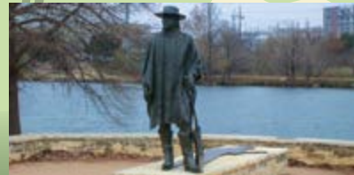
1 - Stevie Ray Vaughan Statue