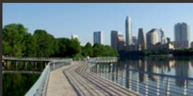
14 - Boardwalk Trail